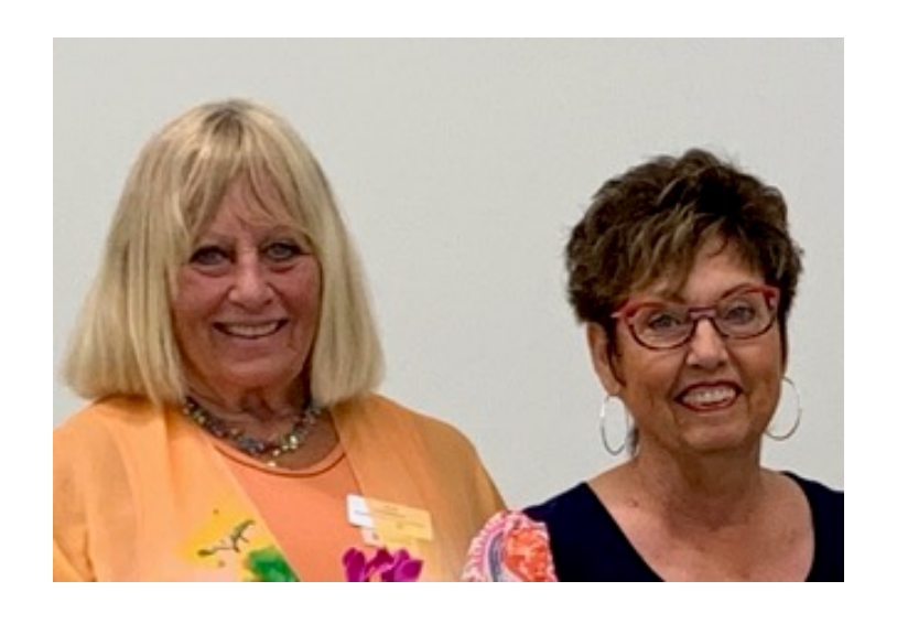
A Message from the Co-Presidents

BRANCH: venice-fl.aauw.net State: aauw-fl.aauw.net National: aauw.org