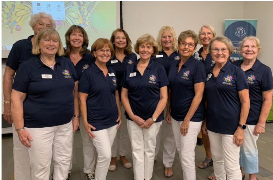
Members modeling our new logo shirts

Please make checks payable to Venice AAUW