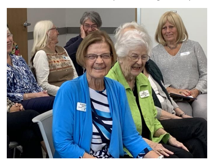
Members react to shared examples of 'paying it forward.'

Members enjoyed the interactive portion of Jennifer's message. As one member stated: "You are speaking to an exceptional group of women – maybe speaking to the choir – but your message is very relevant."