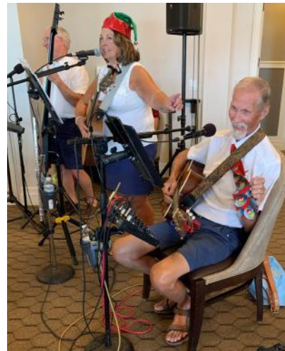
The 3-piece band, Paradise Found, provided festive music.