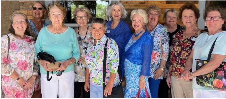
The Lunch Bunch Group at Ken and Barbs in Englewood.