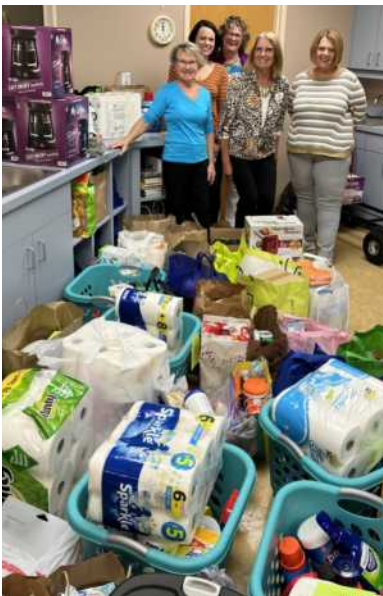
What fun it was to deliver all of our contributions!