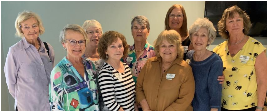
2021-2022 Venice AAUW Board Members