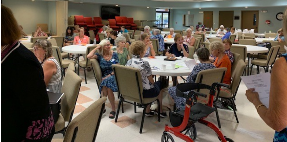
Members enjoyed a “modified return to normal!”