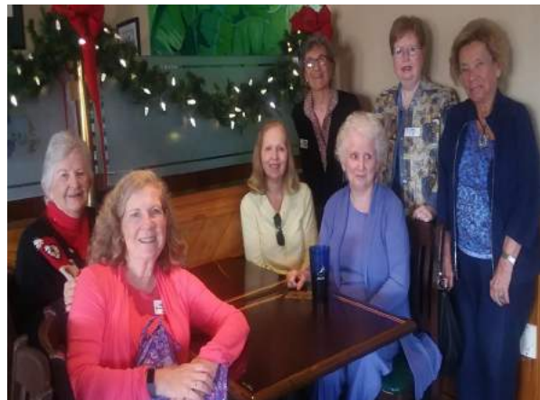
Book Club group members having a delicious lunch afterwards at the Olde World Restaurant in North Port