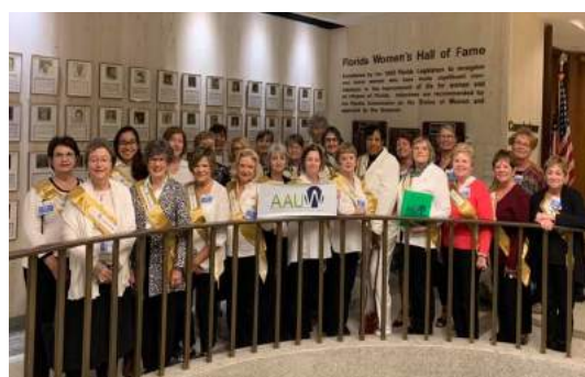
Florida AAUW members who attended Lobby Days