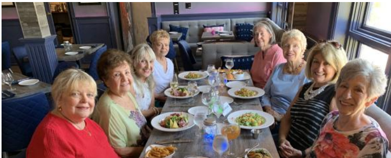
May Lunch Bunch