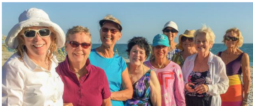
May Coastal Cruising