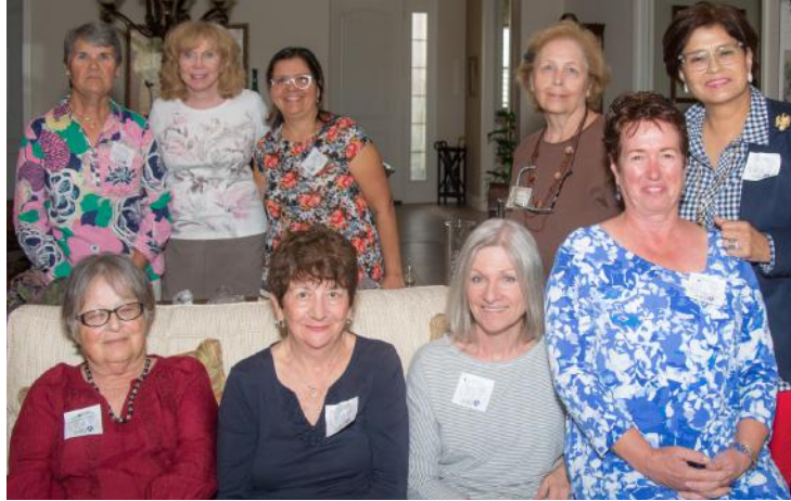
New members who attended the recent breakfast.

If you see any of these new members, be sure to extend your personal welcome.