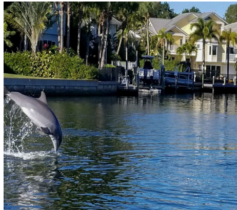
The dolphins jumped for joy!