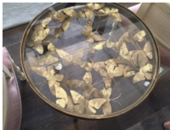
Butterflies on this glass table are part of a theme of one of the homes