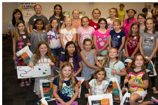
26 girls ages 9-12 participated in the Girls “STEAM” Ahead event.