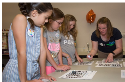
Girls were able to do basic coding that allowed Ozobots to travel around on a paper track they created.