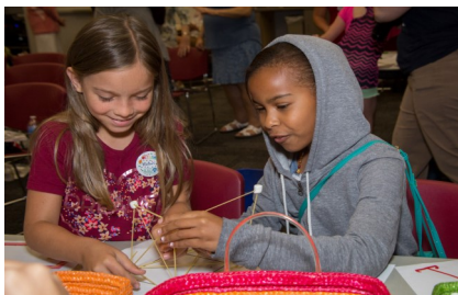
Engineering principles were introduced