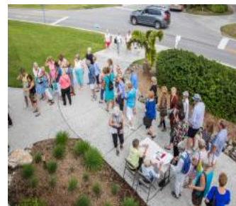
A crowd waiting to tour a Venice Island home on Bayshore Drive

Thanks to everyone who helped put the 2018 Tour over the top. It assures the branch's ability to offer re-entry scholarships to area women through the Gulf Coast Community Foundation again this year. And that's something worth celebrating.