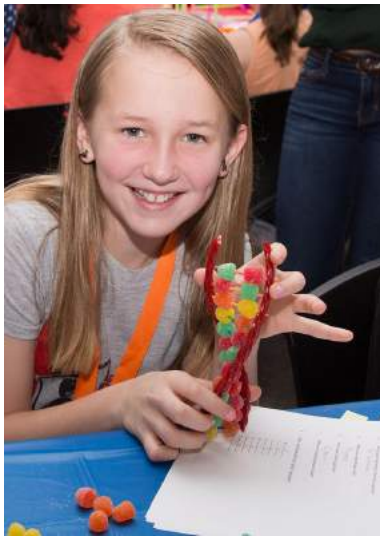
A DNA Explorer

The AAUW STEM committee AAUW members had an organizational meeting with the Jacaranda librarian to plan STEM activities for girls 9 to 12 years old. The title of our event is "Girls STEAM Ahead". We will be holding it on April 28 th at the library from 10 AM until 12:30 PM. The event will have four stations – Science, Technology, Engineering and Art/Math. We are very excited about partnering with the library. Our next meeting is on March 12 th at 10 AM at the Jacaranda Library. Please come and see how you can help.