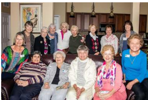
Armchair Travelers, January 2018

Now my focus is on social and environmental justice, and partnering with interfaith and other public interest organizations to promote justice, equity and compassion in public policy. I formed the Sarasota Alliance for Fair Elections (SAFE) in 2006 to support a campaign for paper ballots, which passed in Sarasota County and now is in effect statewide. SAFE's current effort is for Single Member Districts for electing County Commissioners, to help reduce the cost of campaigns, make races more competitive, and make elected officials more accountable to the voters, rather than to big moneyed interests and their PACs. All are invited to help our HI-FIVE petition drive by printing the petition at www.keepdemocracysafe.org and having five friends and acquaintances fill it out. We have an ambitious goal to put this on the ballot this spring! In addition, as President of the board of UU Justice Florida, a statewide action network, I invite all who would like to add your voice on needed legislation for women's rights and other issues for the public good, to join our Action Network at http://www.uujusticefl.org/action-network/sign-up . (This is free and open to the public.) Together we can help change history, as we do good work in so many ways for the education of women and girls.