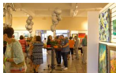
Celebration at Venice Art Center, scene of after party.