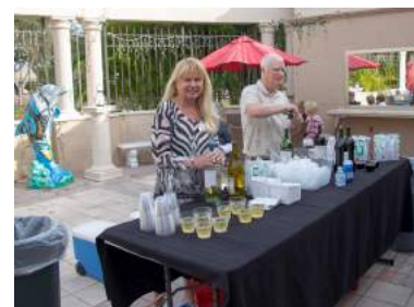
Volunteer Bartenders keep the