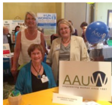
AAUW Display Table