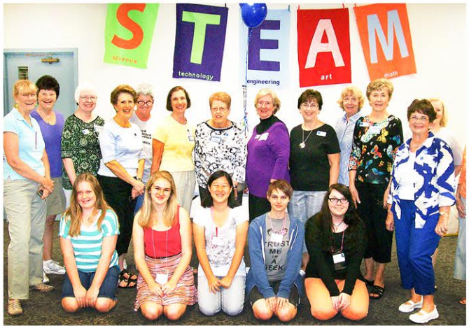
AAUW Venice FL Branch members, librarians and teen volunteers hosted 22 girls who spent the morning exploring projects in Science, Technology, Engineering, Art and Math.